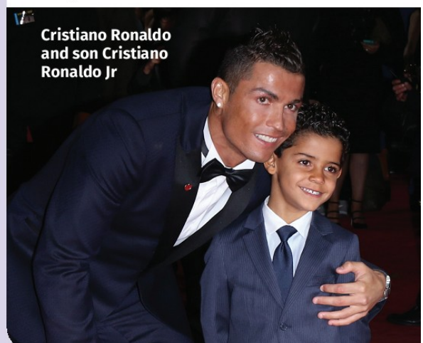
Cristiano Ronaldo and son Cristiano Ronaldo Jr